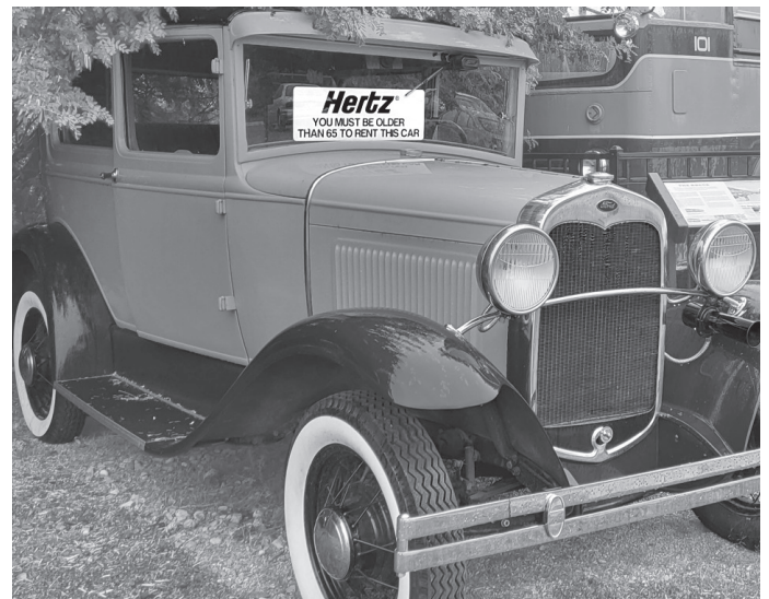
Sign in window: You must be older than 65 to rent this car. ~Unknown source

~With Sincere Gratitude, The Perschke Family